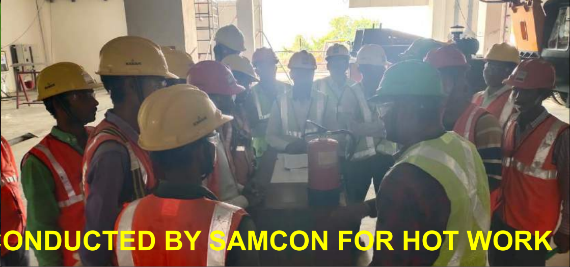
PASS SYSTEM TRAINING CONDUCTED BY SAMCON FOR HOT WORK