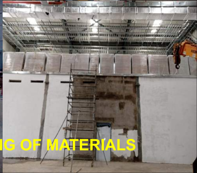
LOADING ,UNLOADING,SHIFTING AND STACKING OF MATERIALS BY FARANA