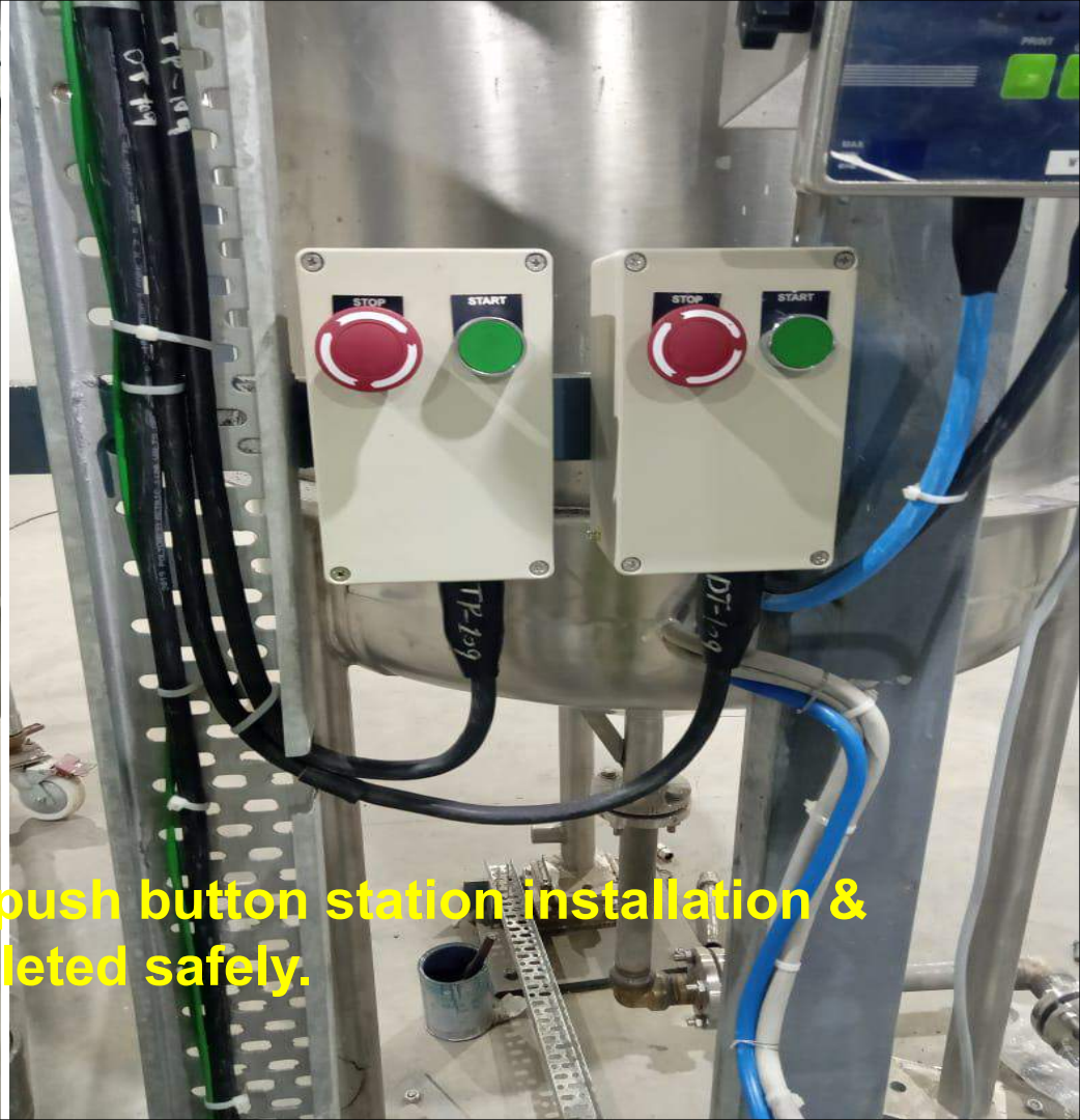
Day tank motor pumps push button station installation & termination work completed safely.